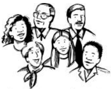
Adult Sunday School

The above are special giving opportunities for those who wish to contribute toward a specific project. Contributions in any amount are appreciated.